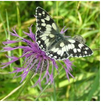
Marbled White butterfly. Can usually be seen in June and July.