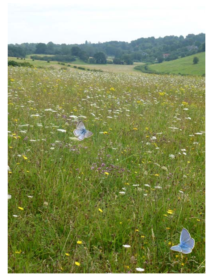
Riding Lane, Holtspur, Near Beaconsfield HP9 1BT

A haven for butterflies and moths – re-created from arable land